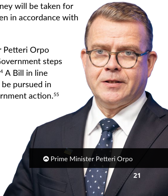
👤 Prime Minister Petteri Orpo

National Coalition Prime Minister Petteri Orpo has recently conceded that any Government steps toward a law now seem unlikely. 54 A Bill in line with the ‘citizens’ initiative’ could be pursued in Parliament, independent of Government action. 55