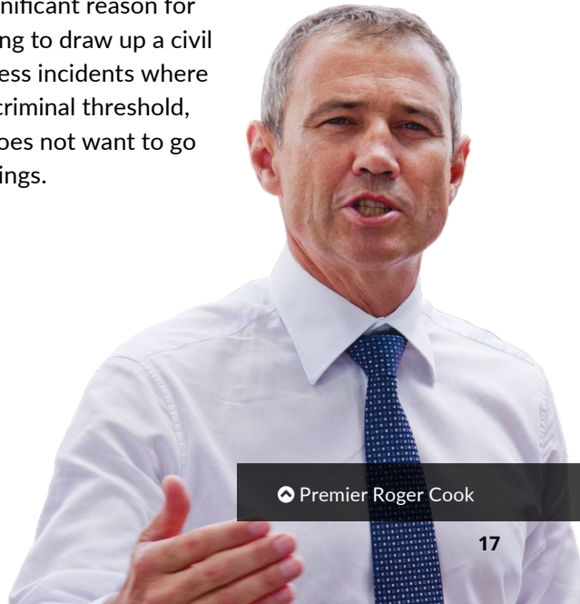
Premier Roger Cook

It is understood that a significant reason for the delay has been in trying to draw up a civil response scheme to address incidents where harm does not meet the criminal threshold, or where the individual does not want to go through criminal proceedings.