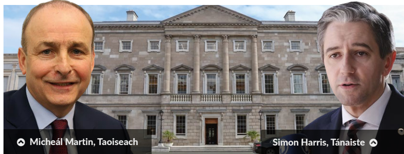
◀ Micheál Martin, Taoiseach